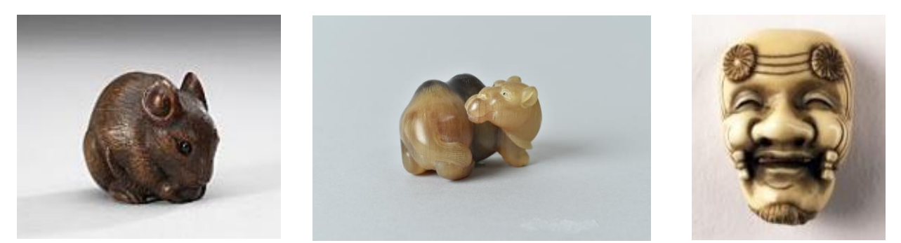
Netsuke, various dates

Visitors learn about the essential role of tactility in the Japanese tea ceremony. Small, hand-held Japanese objects such as tea bowls, netsuke, and incense boxes were sought after by foreign collectors during the japonisme phenomenon. The pleasure of touching these objects is evident from years of handling which only makes them more appealing.