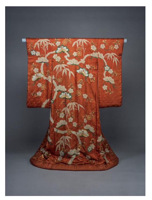
Woman's wedding kimono, 18th century

The exhibition also explores how the latest technologies make textiles responsive - interactive and "alive."