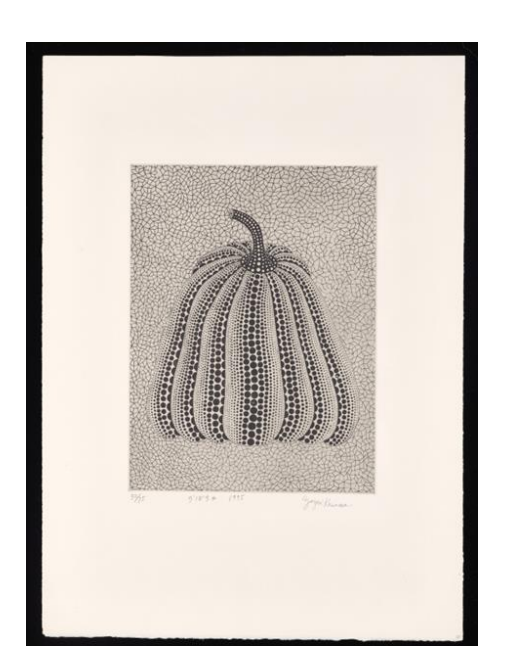
Yayoi Kusama, Pumpkin (Black), e tching on paper, 1995